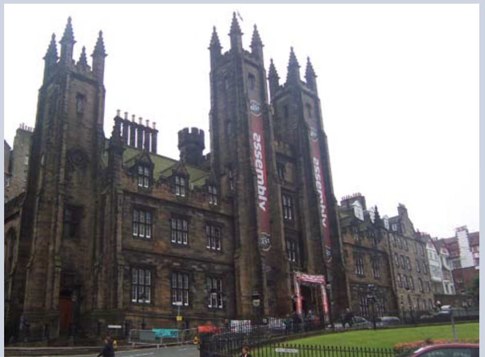
New College, Edinburgh

The Pope has now left Scotland's soil but God's powerful Word and redeeming grace remain. Readers of truth are affected as the powers of light and darkness war on. This is seen in two phone calls which I have received. One enquired, 'What does the righteousness of Christ mean? What does it mean to be an unrighteous person?' The Gospel was given in reply. Another lady expressed outrage about the materials that had been handed out. She was literally foaming at the mouth with vehement anger and threatening remarks. The Word has been given to many and now we trust the Lord's