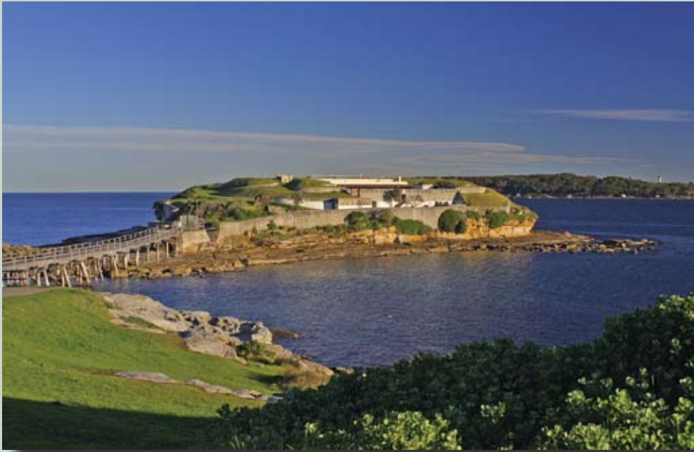
Bare Island and Botany Bay

the day but this was refused. Another Governor would also march his soldiers out of the service when Johnson was half way through causing the maximum amount of distraction. Most of them also refused to give him any help with building churches and on at least one occasion the building which he hoped would become a place of worship was turned into a prison. This meant that he had to try and erect buildings by himself.