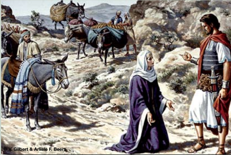
Abigail pleading with David